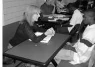
Robert A. Taft Information Technology High School