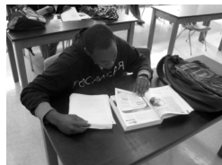
Robert A. Taft Information Technology High School