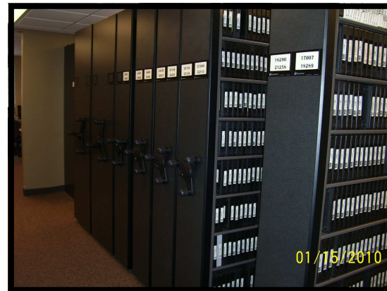
REMC 5 circulated 742 items in the 2011-2012 school year.

Because of the shift from physical to digital resources, the REMC interschool mail courier service was reduced to three days per week in 2011-2012 and is currently operating a two days per week schedule. Savings recognized from this reduction helps to support digital resources, such as Discovery Education Streaming.